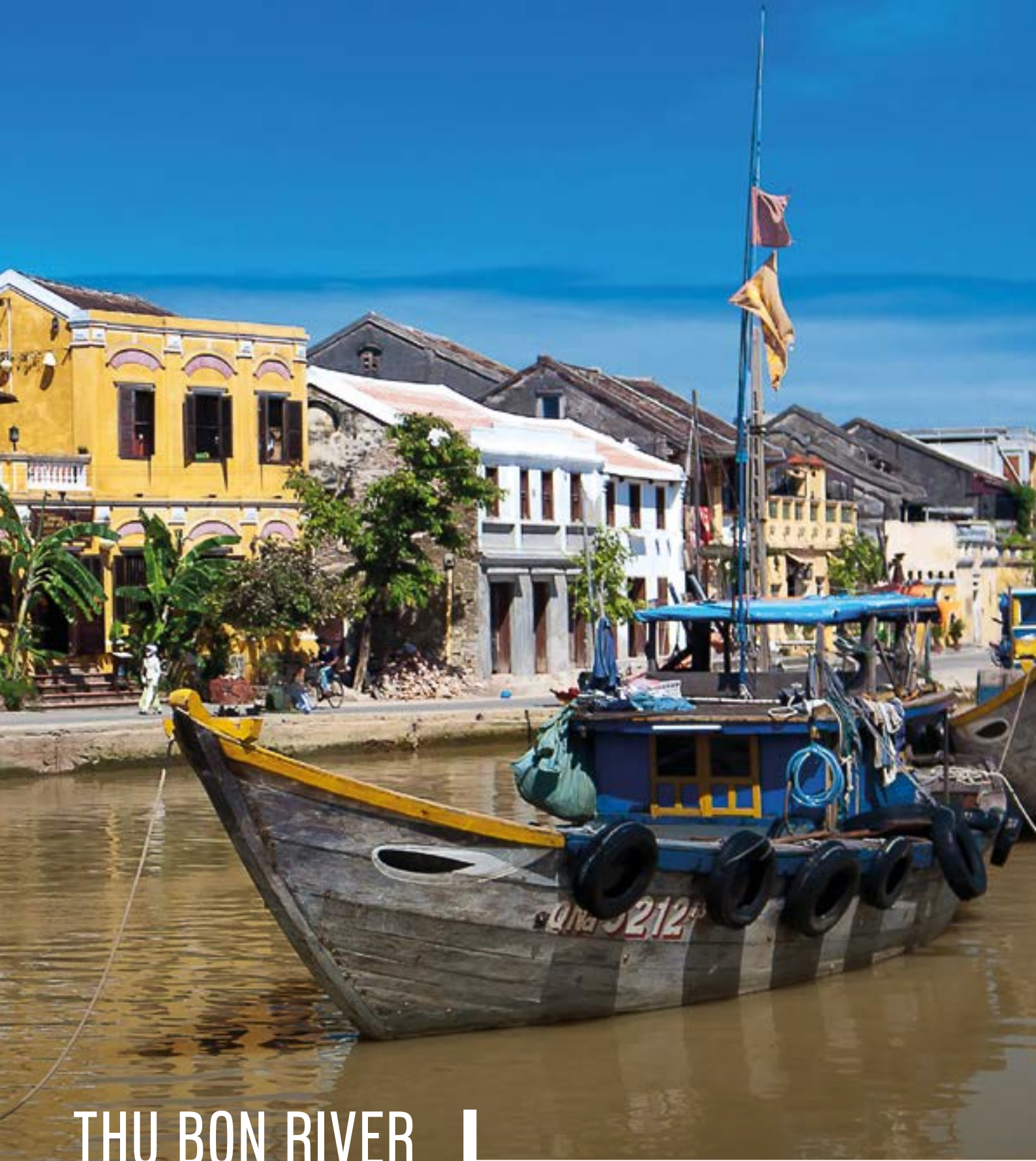
THU BON RIVER