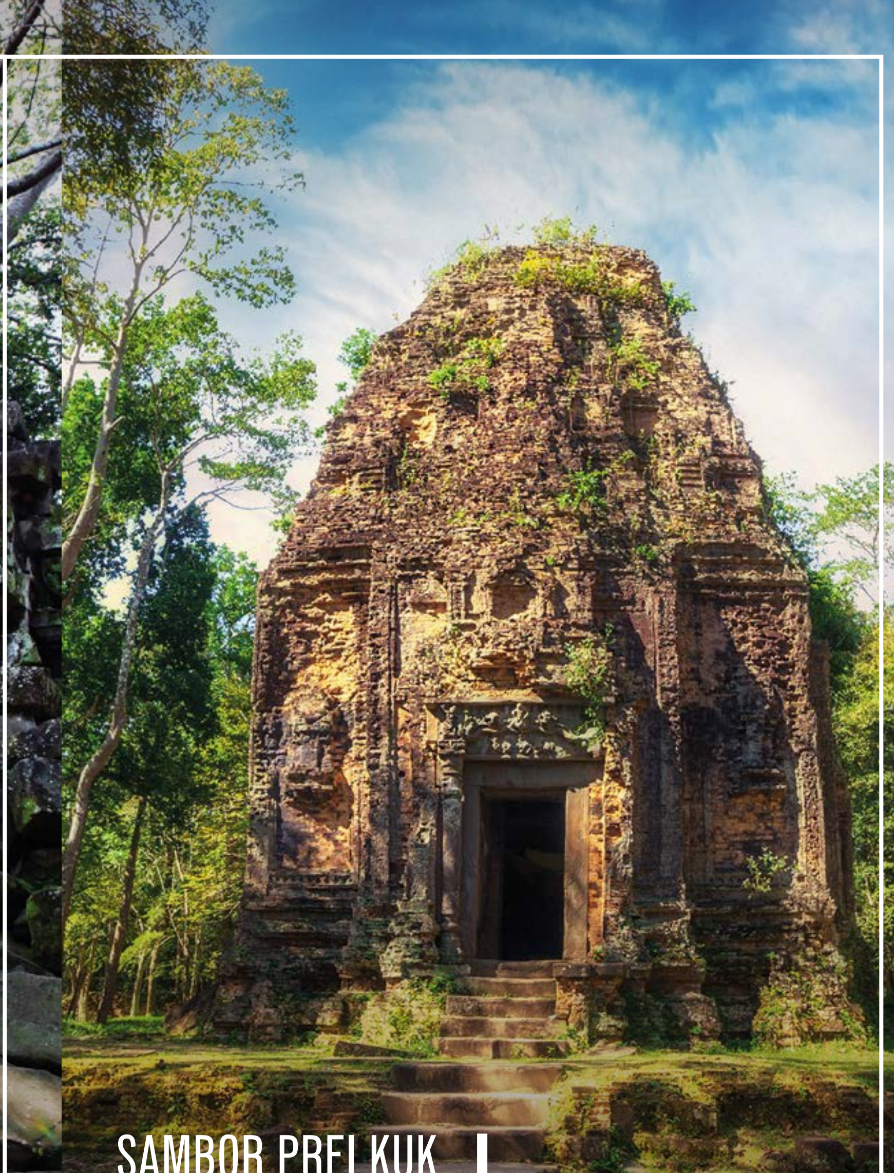
SAMBOR PREI KUK